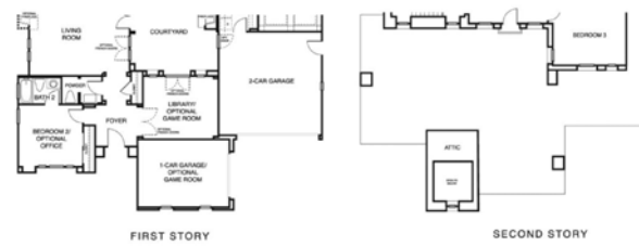
PLAN 1BR PROVENCE