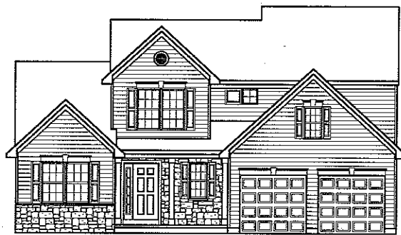
ELEVATION A-20 OPT. TWO DOOR SHOWN