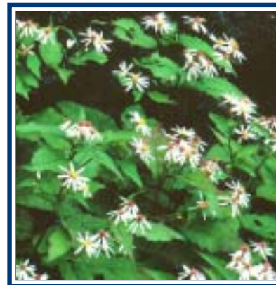
white wood aster

Across the southern slopes is a heath bald shrub community. Carolina rhododendron dominates these clusters of shrubs, which includes two highly fragrant plants: smooth clammy azalea.