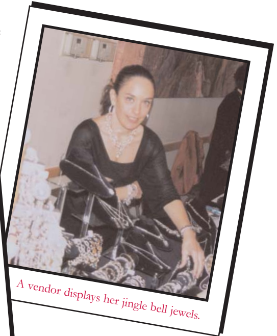
A vendor displays her jingle bell jewels.