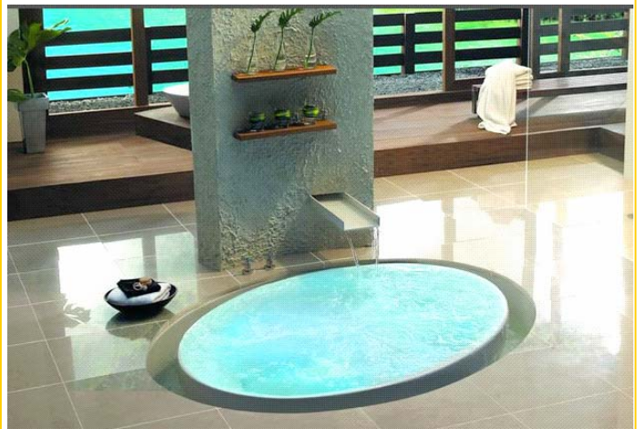
From KÄSCH. This overflow bathtub is designed so that overflowing water is directed back into the tub. Kaesch.net