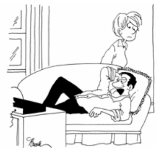
"Don't you hate it when you lose the remote and have to watch shows you hate?"