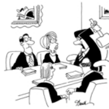
"Before we start, would everyone please put your cell phone in the middle of the table?"

Very few people think the ringing of someone's cell phone is just right. In a study by workforce solutions firm Randstad USA, unusual rings were named as workers' number one pet peeve.