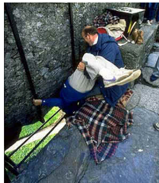
Kissing the Blarney Stone!

If you are working with another Real Estate Professional, please disregard this notice. Copyright © 2009