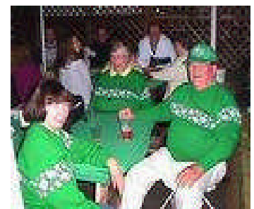
If it wasn't for St. Patrick's Day we would not be able to wear these sweaters!