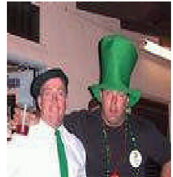
Just Call Me "The Mad Hatter" Have You Seen My Friend Alice?