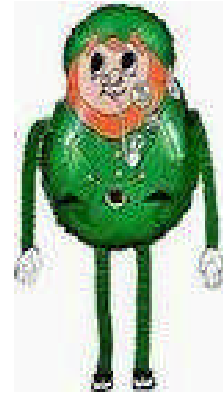
St. Patrick's Day Wouldn't Be Complete Without A Leprechaun!

Much Irish folklore surrounds St. Patrick's Day. Not much of it is actually substantiated. Some of this lore includes the belief that Patrick raised people from the dead. He also is said to have given sermon from a hilltop that drove all the snakes from Ireland. Of course, no snakes were ever native to Ireland, and some people think this is a metaphor for the conversion of the pagans. One traditional icon of the day is the shamrock. And this stems from a more bonafide Irish tale that tells how Patrick used the three-leafed shamrock to explain the Trinity. He used it in his sermons to represent how the Father, the Son, and the Holy Spirit could all exist as separate elements of the same entity. His followers adopted the custom of wearing a shamrock on his feast day. The St. Patrick's Day custom came to America in 1737, first celebrated in Boston. The party night of the year, check out Sully's, Brennen's, and the rest of our local Irish theme Pubs and restaurants. Be sure and have the Green Beer, it is plentiful this night!