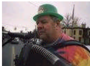
I am Irish! Really! Just check out my hat...