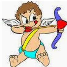
Cupid taking aim....