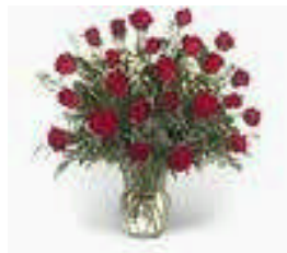
Check out Boulevard Florists for the best Valentine's Day Special on Roses!