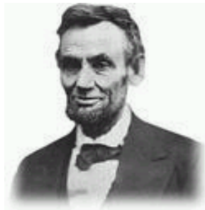
Abraham Lincoln during his Presidency. Obviously in deep thought!