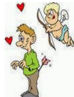
Cupid's arrow can even make the unattractive appear attractive!