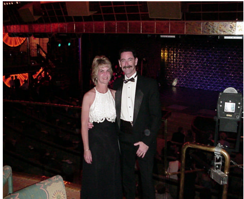
Have fun and make Valentine's Day both romantic and formal!