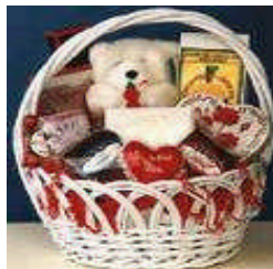
Teddy Bears can be the way to that special person's heart....