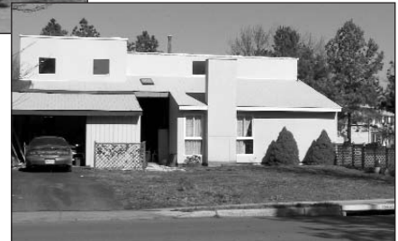
AFTER: Below, house was recovered with a low-maintenance stucco.

we are adding a laundry room, a nice size bedroom, and an office. Upstairs we added a new master suite, master bath, and walk-in closets. Since we built cathedral ceilings in the new section, we were able to fit a storage area above the walk-in closet.