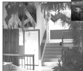
AFTER: The entryway has a more sophisticated look. Notice that the spider plants and wall stripes have disappeared.