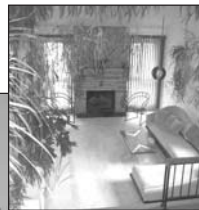
BEFORE: The living room, above.