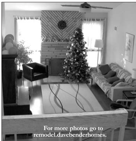
For more photos go to remodel.davebenderhomes.com .

Advice: the more research you do before starting, the better. Also, be very detailed and explicit when writing contracts with contractors.