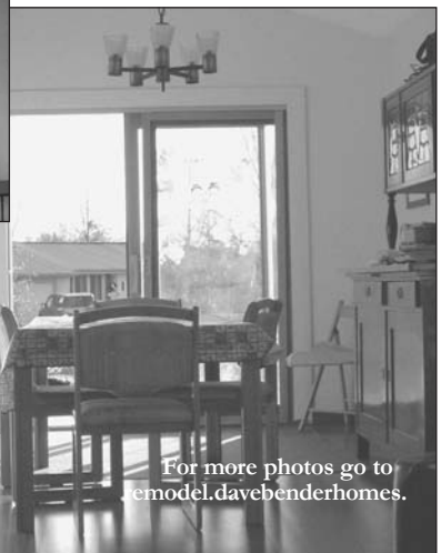
AFTER: The dining room is more inviting.