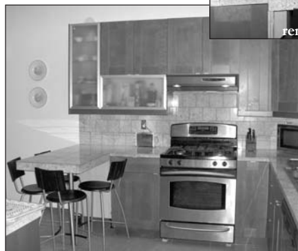
AFTER: Two views of our remodeled kitchen, above and left. We switched from white formica to granite and natural wood. We also got rid of the hanging spider plants!