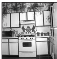
BEFORE: Our kitchen, above.

Eventually, we looked for an architect to do the drawings and perhaps give us suggestions. After we learned how much it would have cost us, though, we ended up only hiring a draftsman.