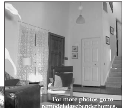
BEFORE: The front entryway, below.