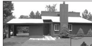
BEFORE: Above, the original exterior of our house was a dark red.

Our remodeling project can be divided into two parts: (1) upgrading the current portion of the home, and (2) building an addition. The addition adds about 1,000 square feet of living space on two levels. Downstairs